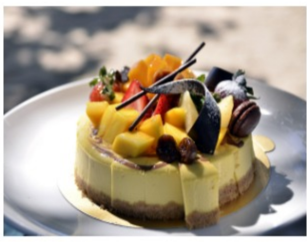
Confetti Cake with Three layers of fluffy white vanilla bean cake with a hint of almond...